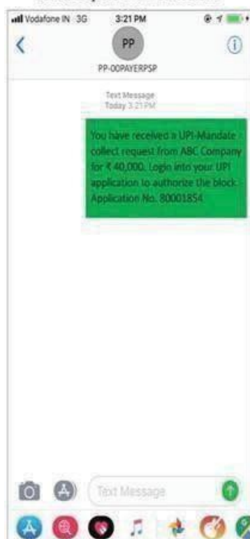
Block request SMS to investor